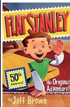
Flat Stanley by Jeff Brown